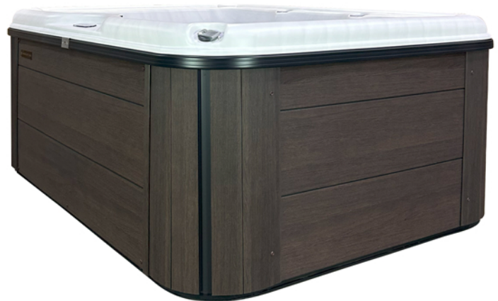
Shell: Drift | Cabinet: Brown