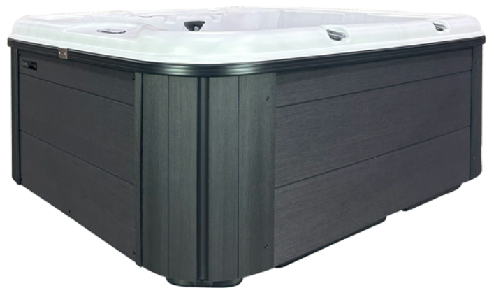
Shell: Drift | Cabinet: Black