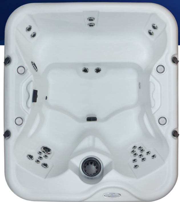
Shell: Drift (Shown with NLP Option)