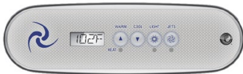
Controller used on All-In-110 Series, Bella Models, Classic, Modern, and Sport Series

STANDARD has 9 options: TEMP, TR:LO/HI, TIME, FLIP, LOCK, HOLD, FLTR, PEF and UTIL